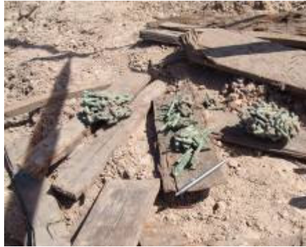
Detonator cache with remnants of packaging showing green colouration on detonators

The materials that could pose a risk were detonators (explosion) and mercury in the soil. The risk would vary depending on the type of mercury: Based on the human health risk calculations, elemental mercury poses an ingestion problem at levels >2000mg/kg. From an inhalation point of view mercury is dangerous at exposure levels >0.15mg/m 3 /h. Organic mercury at levels >200mg/kg poses a potential risk. The aquifer had been classified as a “minor aquifer” due to high natural salinity and poor yields and mercury at <math>40\mu\text{g/l}</math> was deemed acceptable. The water is non-potable and would/could not be used for irrigation purposes and is held in a clayey geological horizon with low transmissivity. If it were to be released, it would in any event be diluted >1000 times, with storm water