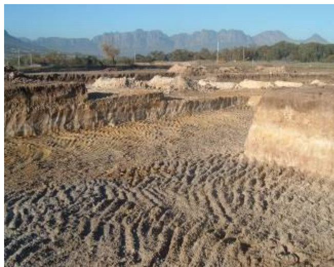
Mercury fulminate plant area after excavation