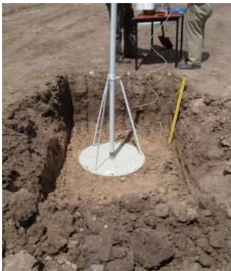
Flux chamber in operation

The challenge was to find an effective means of only disposing material that posed a human health risk. A cost effective approach required a reliable method to identify obvious areas requiring disposal. This can be followed by more extensive testing to refine the boundaries of contamination. A flux chamber was developed to measure real time vapour measurements on site. This provided a rapid means for finding vapour “hot spots” that exceeded human health risk levels. Vapour levels were measured using a geo-referenced grid. Where these levels exceeded