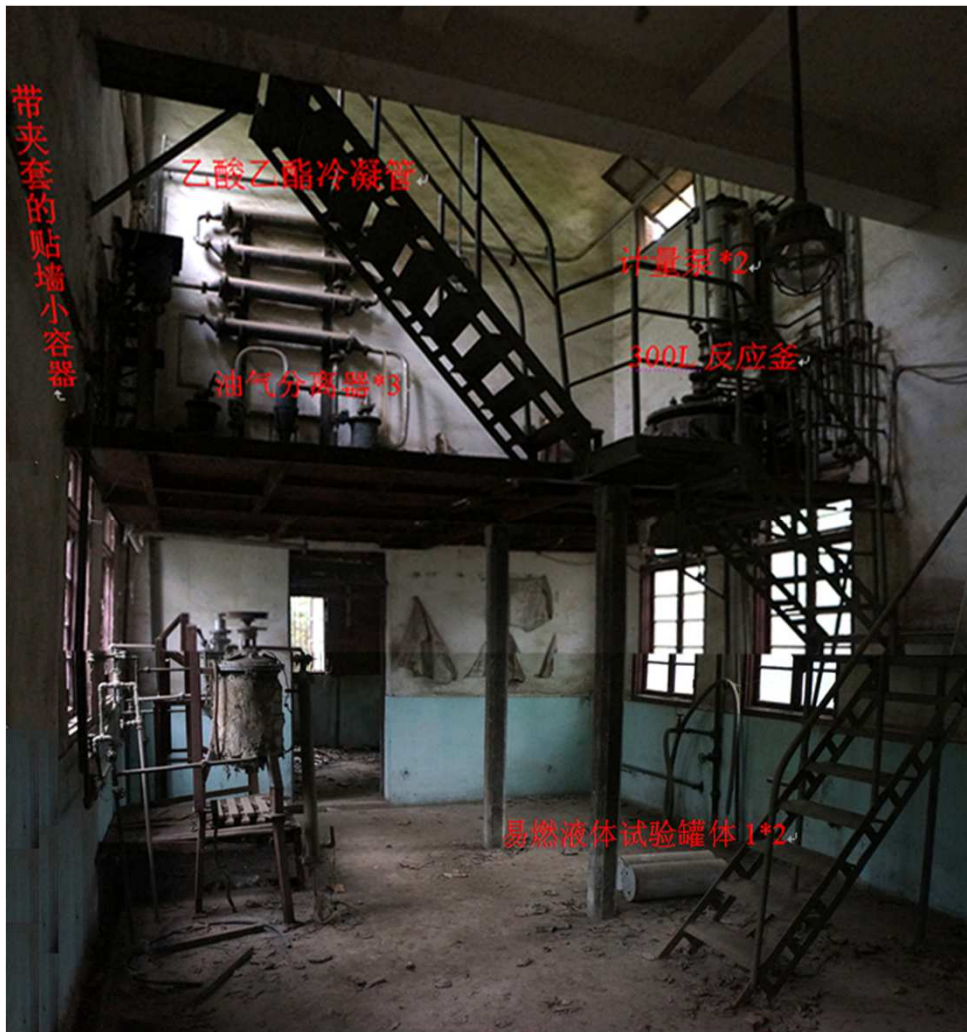
The internal structure of the accident room