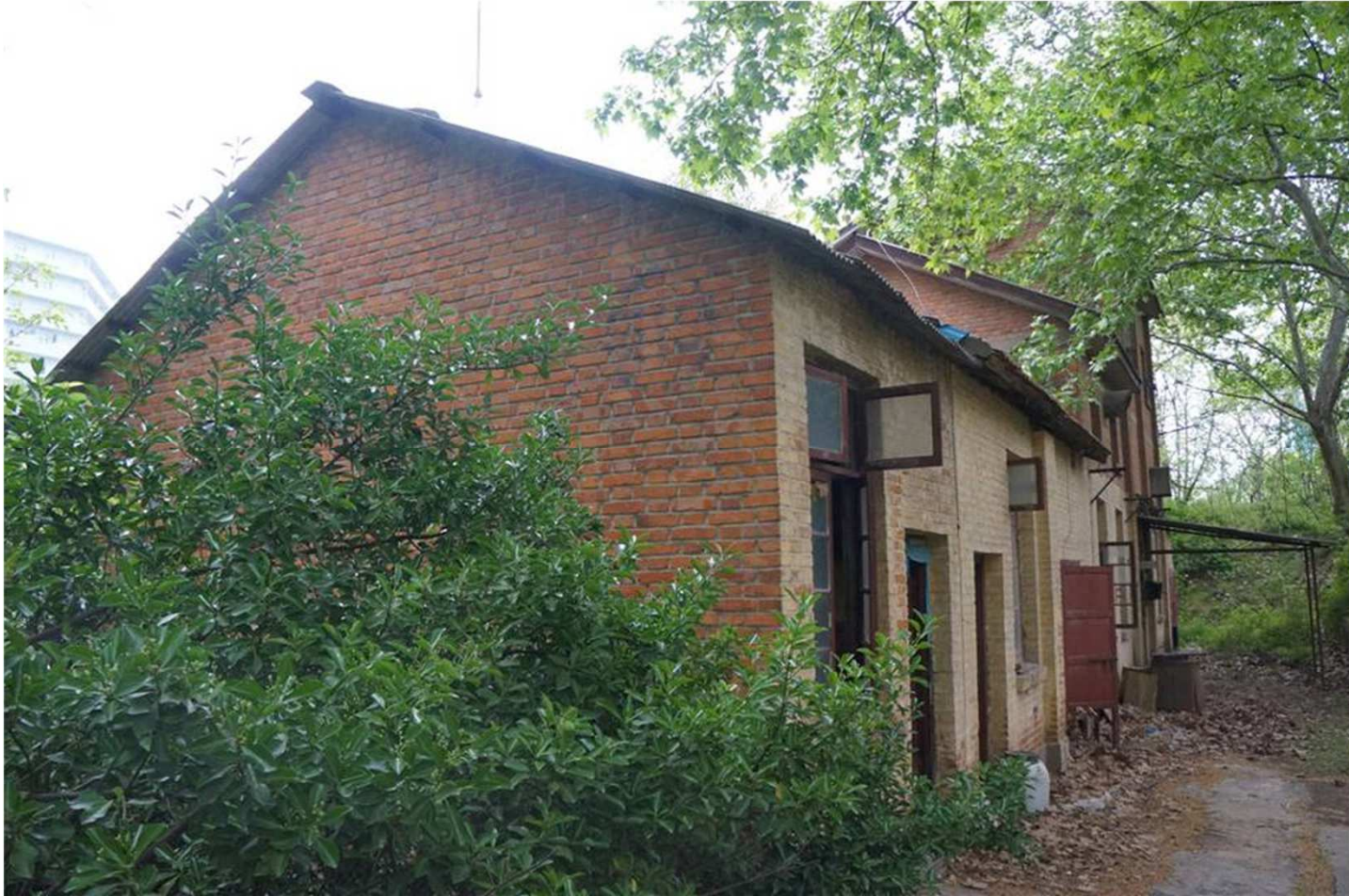
Workshop 819 of the experimental facility before the accident